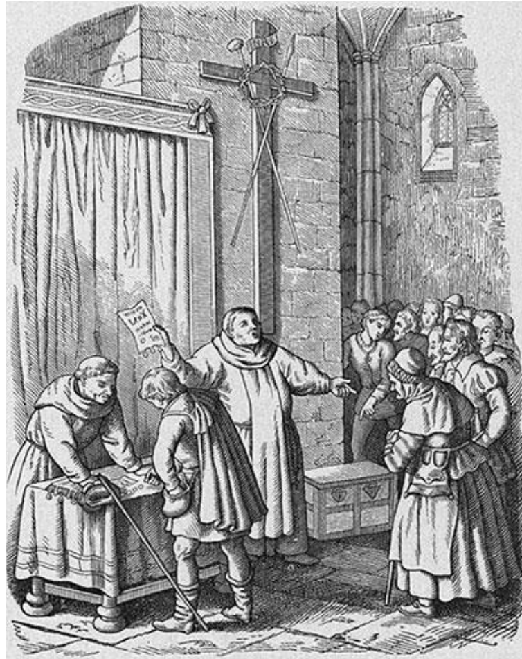
Illustration of German Dominican preacher Johann Tetzel (circa 1465 – 1519) selling indulgences inside a church.